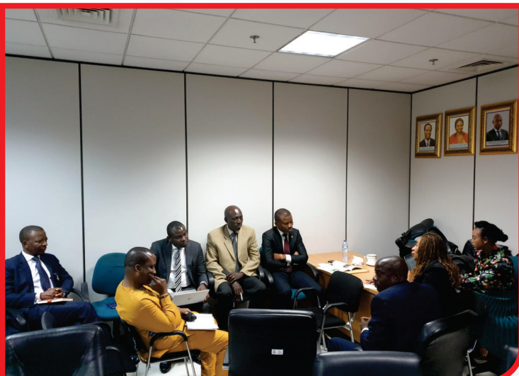
Cross-section of Stakeholders during the break-out session at the Workshop