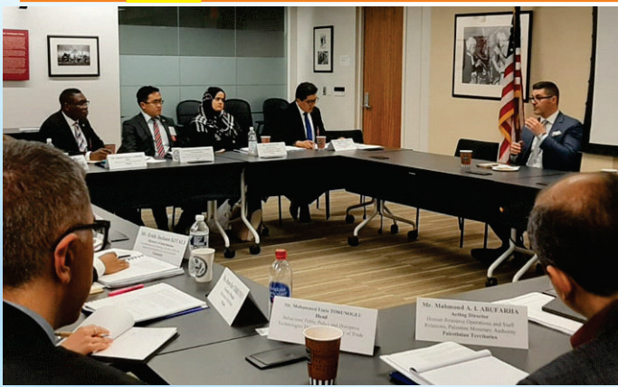
Participants at the IVLP Exchange Programme

According to the World Bank, In 2016, the global digital economy was worth about USD 11.5 trillion, equivalent to 15.5% of the world's overall GDP, and is expected to reach 25% in less than a decade. It also noted that to achieve an inclusive Digital Economy, the private and public sector need to synergize and provide key foundation elements which include; Digital Infrastructure, Digital Platforms, Digital Financial Services, Digital Entrepreneurship and digital skills.