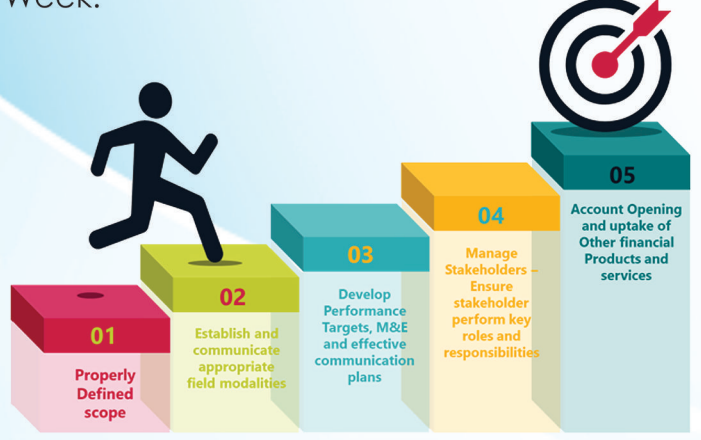
Steps to achieve an impactful Financial Inclusion Week

One of the key outcomes of the meeting was the approval of the Strategic Plan for the Financial Inclusion Week; with the directive that all financial sectors feature prominently in the event. The Committee further directed that only one edition of the Week should be scheduled in the 3rd quarter of 2020 in consideration of the COVID-19 outbreak. The following strategic steps were presented to enable the achievement of the overall goal for the Financial Inclusion Week: