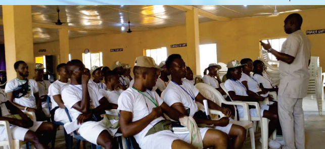
Training of Volunteer Corps Members in session