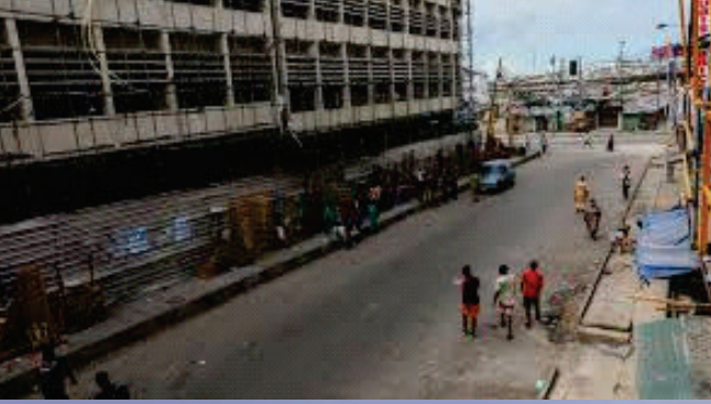
Contrast: Popular Lagos Market, in Nigeria before and during the COVID-19 lockdown