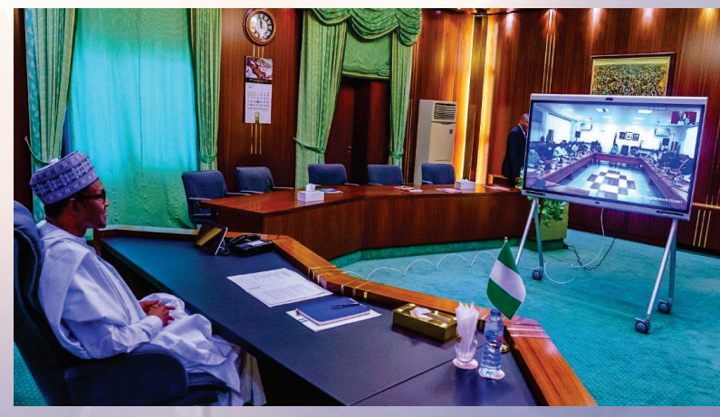
PRESIDENT MUHAMMADU BUHARI on a teleconference meeting with the Presidential Task Force on COVID-19.

Given the magnitude of the COVID-19 pandemic, governments in different jurisdiction have recognized the need to develop fiscal and monetary policy measures to stem the effect of the COVID-19 and limit its human & economic impact