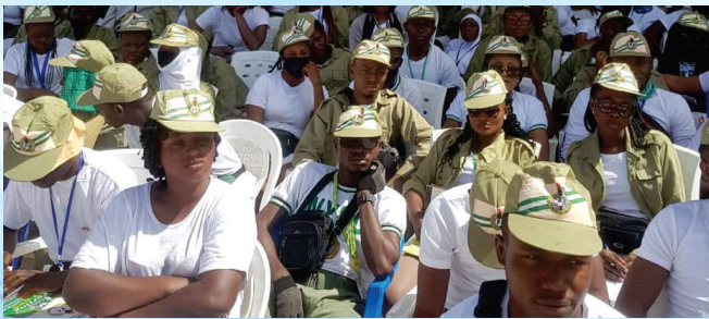
Cross-section of VCMs at the NAPGEP Sensitization Workshop