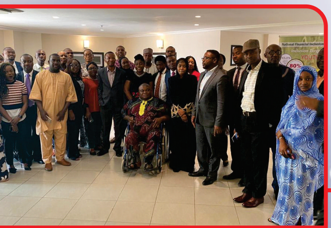
Participants at the 2020 National Financial Inclusion Stakeholder Forum